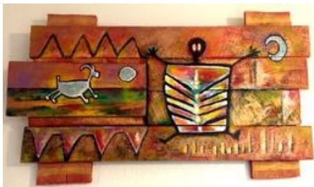
Exhibit through Tuesday January 3, 2017

"Color & Vibration" is a multi-media exhibit of paintings on a variety of media, created to celebrate the original design elements of the petroglyphs with a modern twist of bright color and pop. Many of the works are painted directly on three-dimensional reclaimed wood structures, letting the texture, shapes and surface imperfections