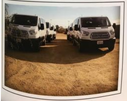
The Wine Tour and BeerTasting