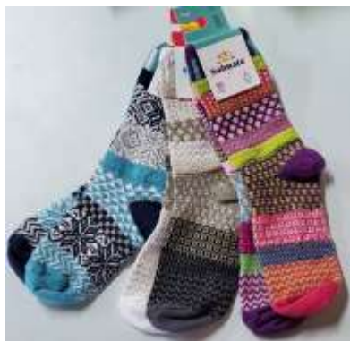
Fun things in the gift shop.

Children's Hour is set to begin the New Year on Flex Friday January 19, 2024, 10:30 - 11:30 a.m. The Children's Hour Group is enthusiastically looking forward to welcoming young children plus older siblings to the first of our free Winter programs. Families are encouraged to consult the Maturango Museum website www.maturango.org in early January for all of the monthly dates and program themes. More information about this January's program also will be available in The News Review and The Daily Independent newspapers.