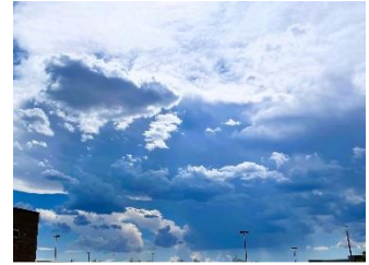
Wow Spring Weather!!!

Preserve, interpret and develop an appreciation for the natural and cultural history of the Northern Mojave Desert. 100 E. Las Flores Ave., Ridgecrest, CA 93555 Open Monday – Saturday 10 am – 5 pm, Sunday Noon – 4pm 760.375.6900 www.maturango.org Death Valley Tourist Center Northern Mojave Visitor Center