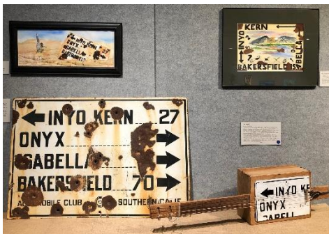
From 2022 ARTifacts Exhibit: old highway sign inspired 2 paintings and a homemade banjo!

The Opening Reception will include artists' introductions, light snacks, and festive conversation. All opening receptions are free and open to the public.