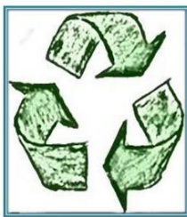
An Eclectic Array of Pre-owned Artwork For Sale