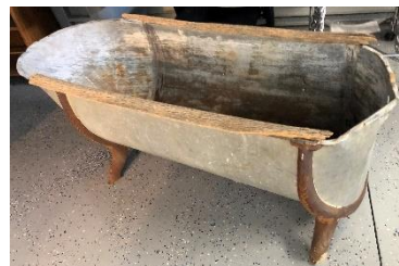
A few of the items to inspire artwork for 2024 exhibit: a cormorant, Pancho Barnes' bathtub, and a Galileo thermometer.