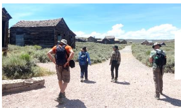
Photos from Bodie trip in July.