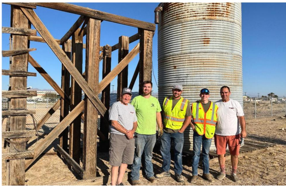
Tank and large equipment relocation thanks to a generous donation from the Rosser Corp.