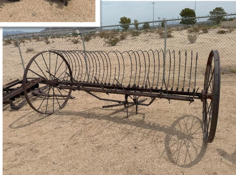
Historical Artifacts Returned After Long Term Display at Fairgrounds